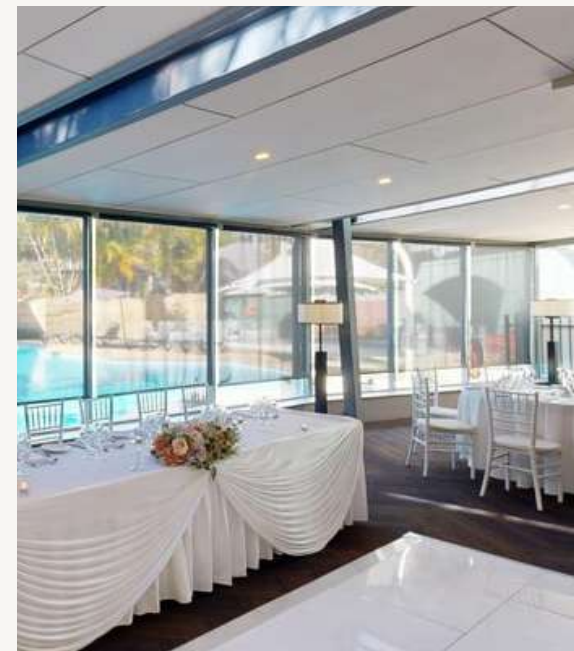
Waterwall Restaurant & Bar