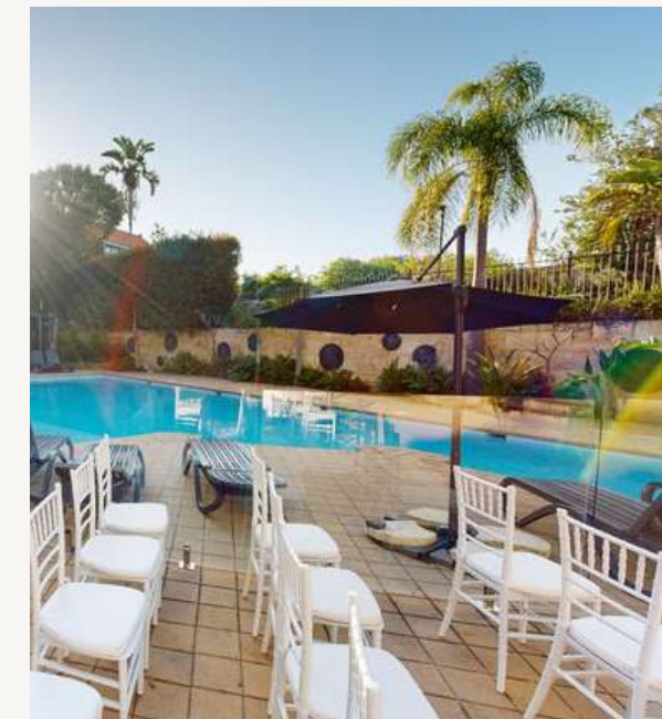
Poolside Ceremonies at Pagoda